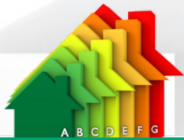
Energy Efficient Cities Energy Efficient Cities

ONEPLACE platform enables users to exchange experiences, identify good practice & draw conclusions and remarks which they can disseminate to urban policy/ energy planners