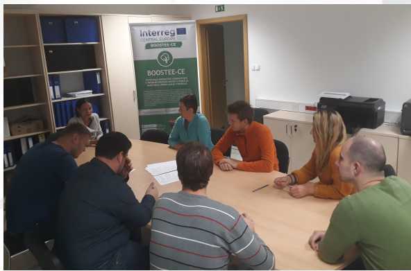
The 2nd focus group meeting of project BOOSTEE-CE held in Velenje.

City of Velenje and E-Institute organised the 2nd focus group meeting of project BOOSTEE-CE held in Velenje on 10th and 29th of October 2018. The event was divided into two parts (meeting with local business, support organisation and with regional energy agency). The participants were informed about the progress of BOOSTEE-CE and local pilot – installation of smart meters in the Music School Fran Korun Koželjski Velenje by Municipality Velenje. The focus of the discussion was on first intermediate results of pilot action and on the first draft of OnePlace platform.