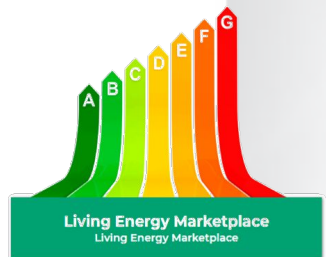
Living Energy Marketplace Living Energy Marketplace

Database covers the electronic & electric appliances. It connects customers interested in EE projects to qualified contractors / energy experts.