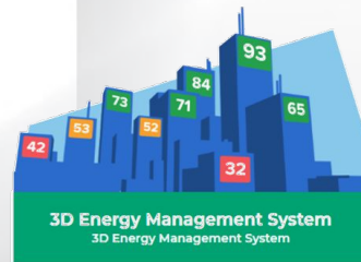
3D Energy Management System 3D Energy Management System

WebGIS tool for better assessment of energy use within the public buildings and visualization of energy audits onto 3D city models .