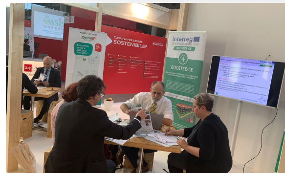
The 4th FGM of project BOOSTEE-CE held in Rimini.

The Emilia-Romagna Region organized the 4th Focus Group Meeting (FGM) within Ecomondo International Fair, 22nd ed. hosted in Rimini. The FGM has provided a recap of the Project, objectives and actions with a specific focus on the OnePlace Energy Platform , which enables users to exchange experiences, identify good practice & draw conclusions in energy efficiency. The participants have discussed with the Emilia - Romagna Region representatives, providing them with ideas and suggestions that will be brought to the attention of the partnership.