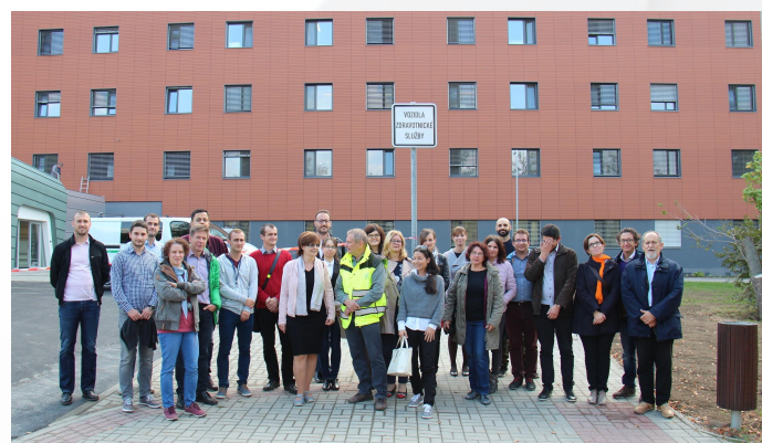
The BOOSTEE-CE project team visiting the Pilot Action in the Czech Republic - the new hospital in zero energy demand standard in Uherské Hradiště

The fourth BOOSTEE-CE project partners meeting was held in Zlín, Czech Republic on 18-19 October, 2018. Partners met to review, discuss and evaluate the project's progress, test the OnePlace-3DEMS tool and to plan successive activities. Within the meeting we have discussed the activities for the incoming 3rd reporting period and mid-term review.